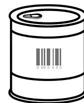
Inspection of all kinds of codes